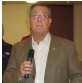
Moment by Chuck