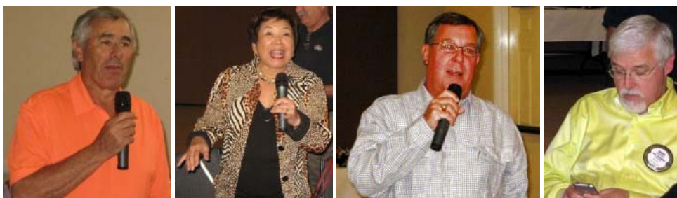
Senior Distraction: "Now let's see, did I remember to pay my AMEX bill or not?"